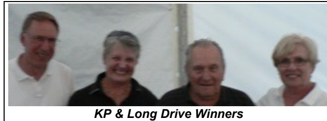
KP & Long Drive Winners