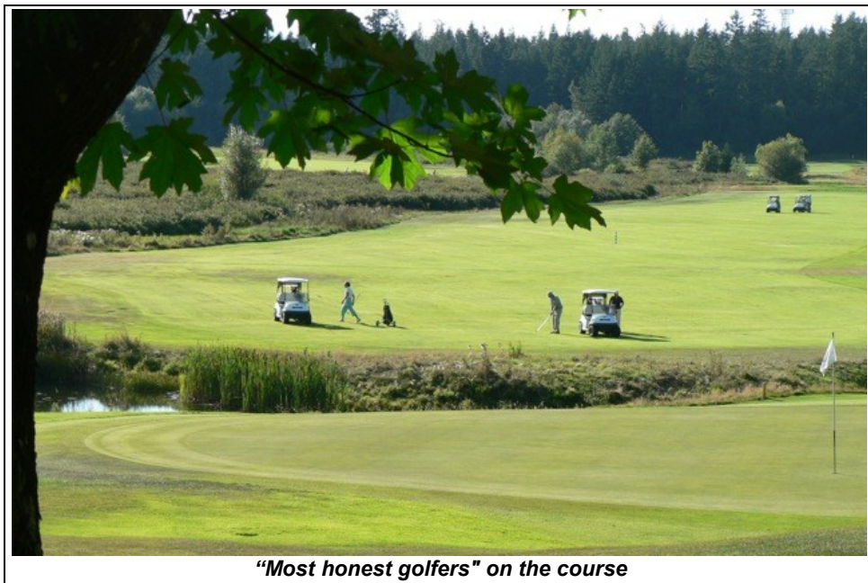
"Most honest golfers" on the course