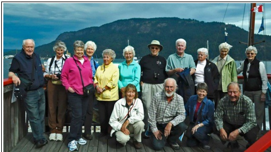
The group at the end of the dock at the Cowichan Bay Maritime Centre