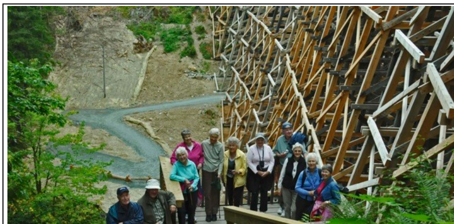
At the Kinsol trestle